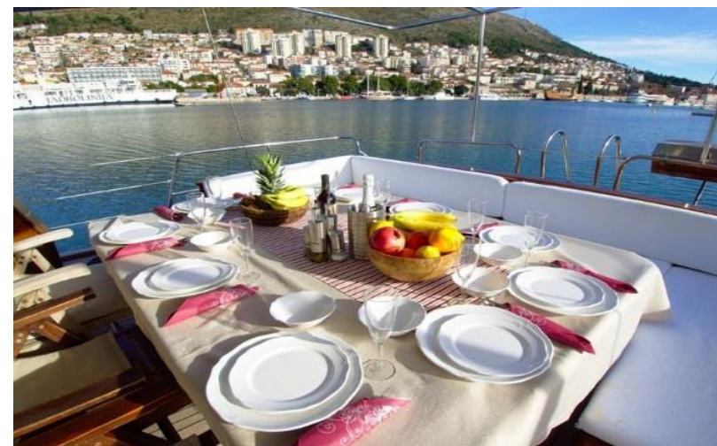
M/V Adriatic Holiday